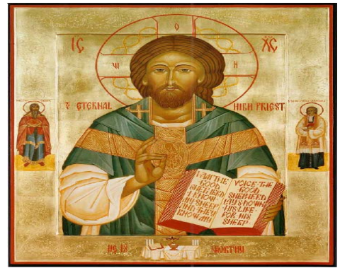
Year for Priests June 19, 2009 - June 19, 2010 Peoples' Prayer for Priests

Pope Benedict XVI, Address to Participants in the Plenary Assembly of the Pontifical Council for the Family (4/5/08)